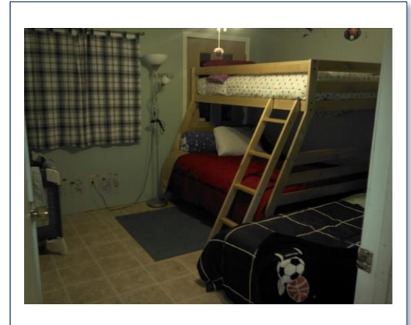
New Room at the Shelter