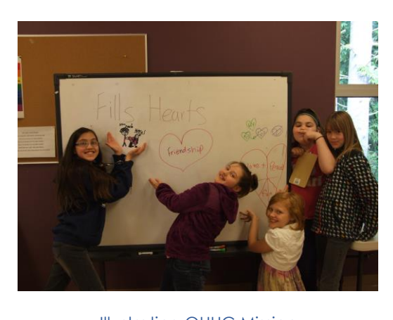
Illustrating OUUC Mission

m for 8th graders is looking very successful so far. The monthly Community Night Dinners have been wonderful, and the monthly Way Cool Sunday School program came into its own this year and is genuinely giving the children a chance to "do church" themselves, and not just learn about it.