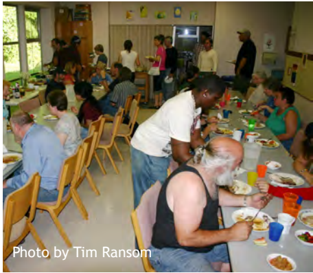
Camp Quixote dinner at OJUC