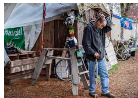
Camper in Camp Quixote