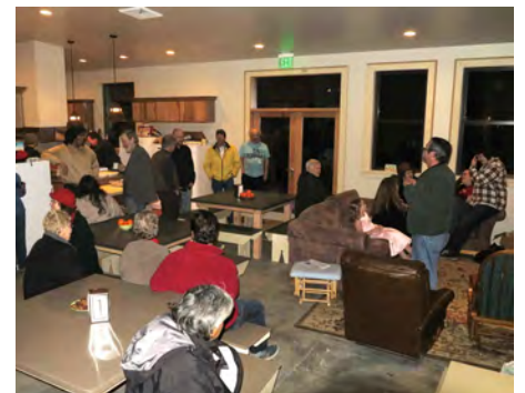
Residents in community room