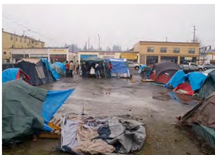
Camp downtown in 2007

After heated debate the Board reached consensus to offer sanctuary, and the next day the campers began their move to our property. Within days special congregational and neighborhood meetings followed; overruling the