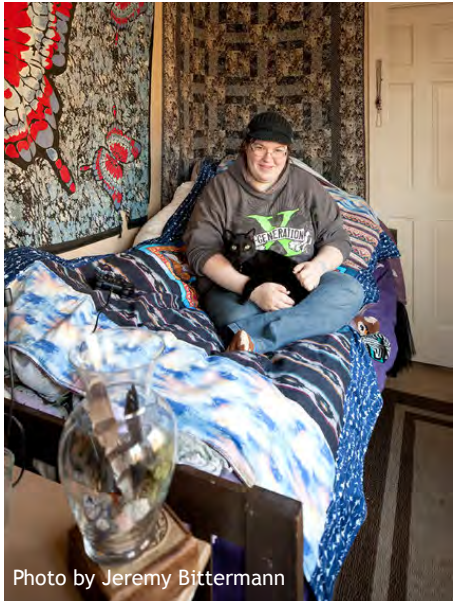
Resident settled at Quixote Village