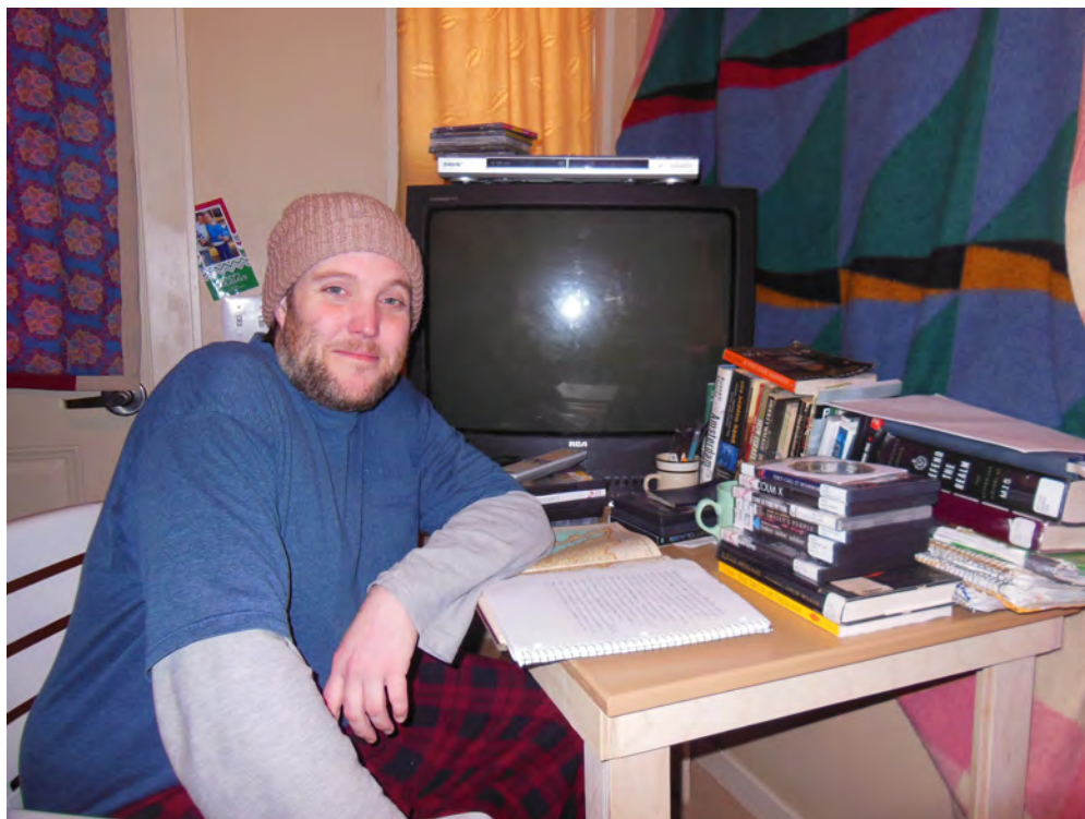
“My natural habitat – sitting at my writing and reading desk with bookshelf. Living here is such a blessing, it’s almost surreal. I’m very grateful for it.”

Homelessness and addiction are so bound up together that they can appear synonymous. I was very lucky to travel abroad in my early 20s, and in Amsterdam there were signs everywhere saying “No Junken”. To them addicts and the homeless were the same. Homeless and addiction are often symptoms of the same psychological disorder. Often the disorder is just enough to cause the sufferer to turn to illicit drugs