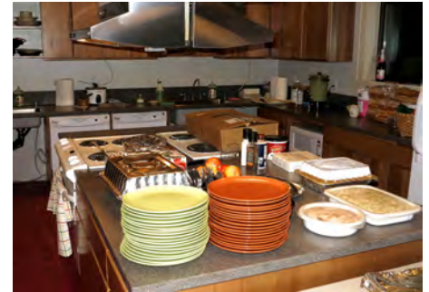
Kitchen with dinner ready to serve

The rest of the story is one of a community—the constituency built during seven years of fighting for and growing support for Camp Quixote—coming together to make the Village happen. There is not space here to list all the people, churches, businesses, elected officials and staff that went to extraordinary lengths to help as we sought additional funding, responded to the concerns and then legal attacks of some of our