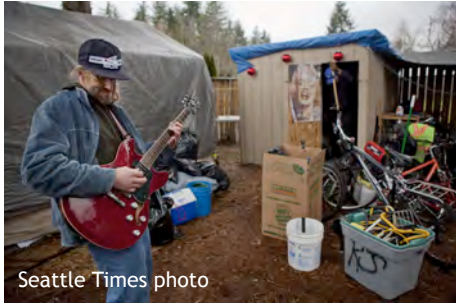
Resident of Camp Quixote

Once housed in a safe home, people can focus on healing and moving forward.