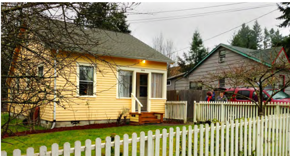
Valentine House in the Eastside Neighborhood of Olympia

Recently a fourth woman signed her lease, got her key, and joined the