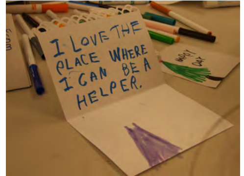
Children in Religious Education classes created care packages that the kids can carry in the car and give to homeless neighbors when they see them. This simple little gift bag is a neighborly thing to do and makes a difference in understanding 'right relationship'.